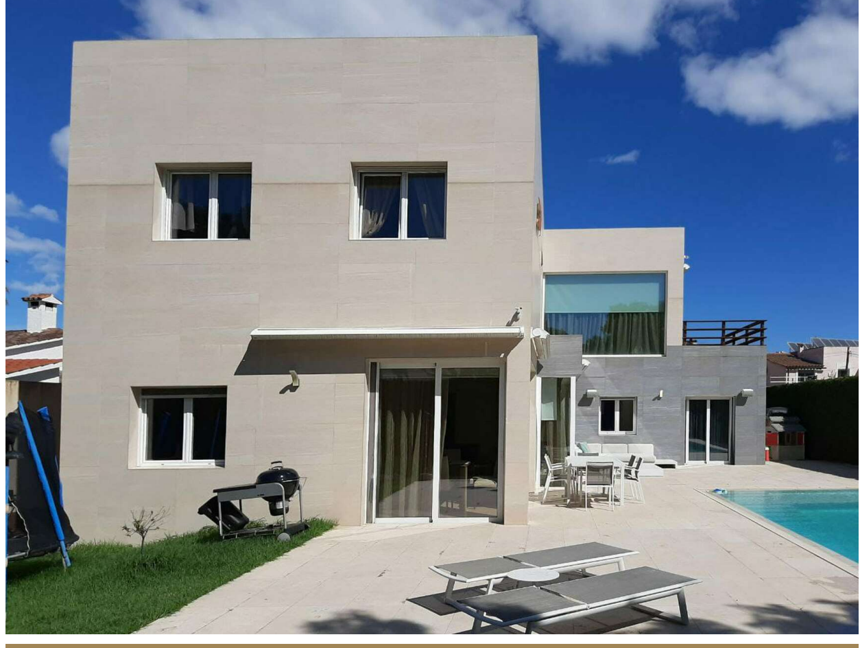
Goertz und Partner 2021 S.L.U. B-02834166

Teléfono +34 972 45 28 76 - E-mail: nb@goertzundpartner.com Club Nàutic Puerto · Edif. Nausica A - Poblat Típic - 17487 Empuriabrava (Girona)